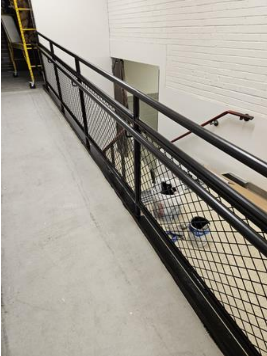
Painting the Ramp Handrail