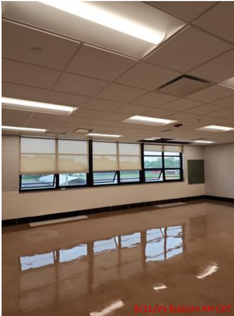
NW Classroom Completed