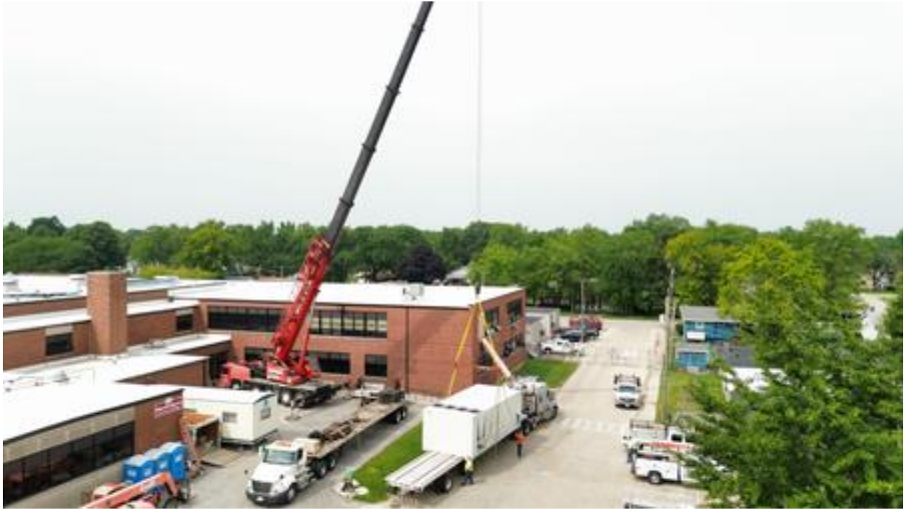
RTU 1 Delivery & Rigging