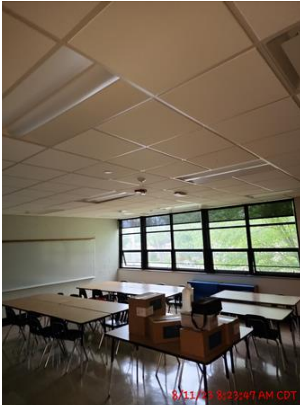
Furniture Installed NW Classroom