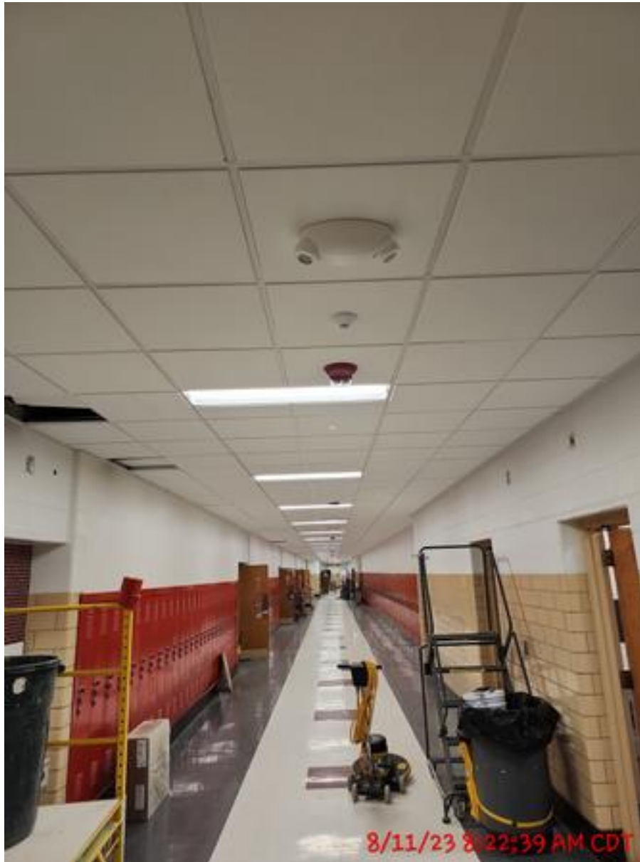
NW Second Floor Corridor