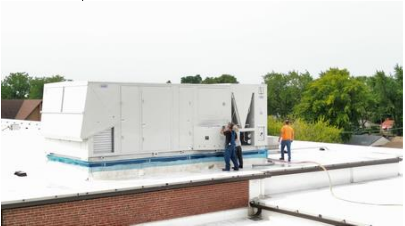
RTU 1 Set on Curb